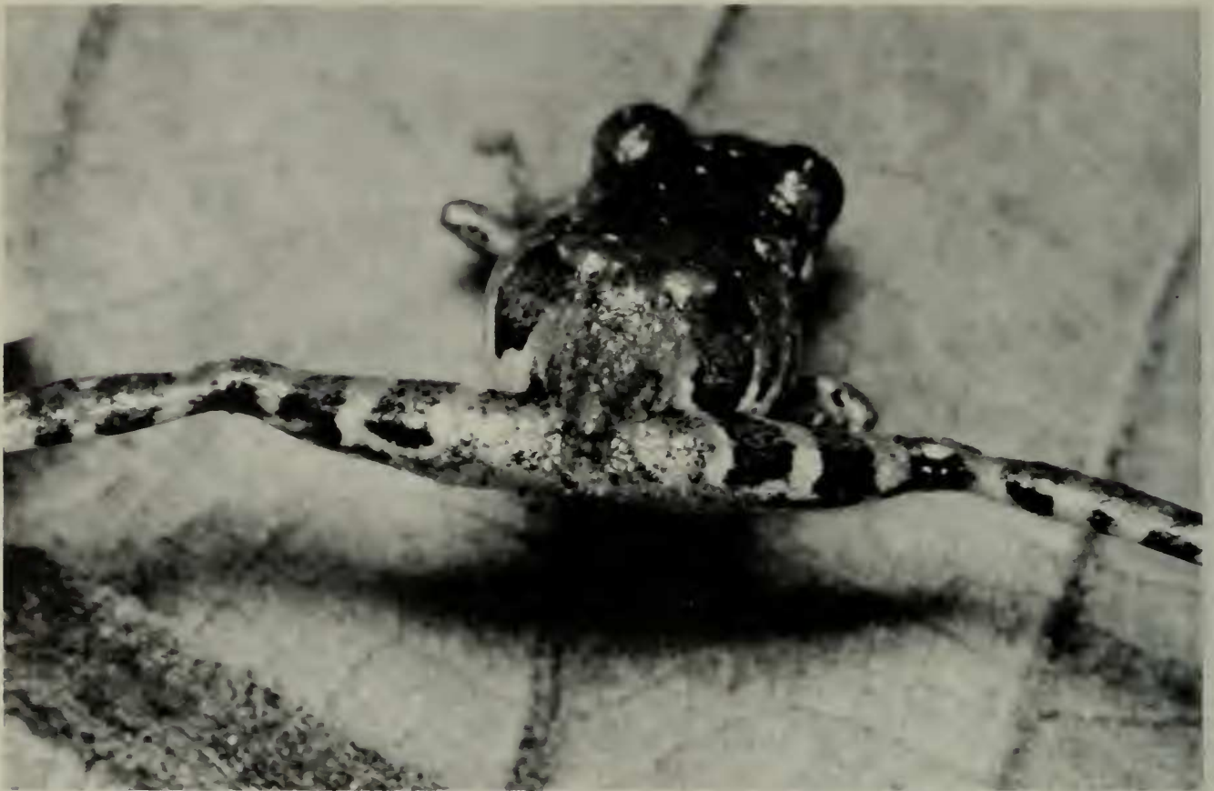
Fig. 2. Pattern of posterior surface of thighs in Eleutherodactylus polymniae , paratype, UTA A-23511.

1970b). Other than sharing distinctive digital pads, few characters have been reported to suggest that this group is monophyletic. Geographically, the group is relatively compact, with 11 species along the Atlantic coastal plain and versant from Tamaulipas, México, southward through much of the Yucatán Peninsula to the mountains of northern Guatemala. One species, E. guereroensis , is restricted to the Pacific versant, and another, E. stuarti , occurs on both the Atlantic and Pacific side of the Continental Divide (Fig. 4). Most species have extremely restricted montane distributions, and many are known from fewer than half a dozen specimens. Eleutherodactylus alfredi has a wide distribution, ranging from east-central Veracruz (Smith & Taylor 1948) to Tabasco (Lee 1980) and Piedras Negras, Guatemala (Duellman 1960, Stuart 1963). Eleutherodactylus decoratus occurs along the Atlantic slopes of the Sierra Madre Oriental from southern Tamaulipas to central Ve-